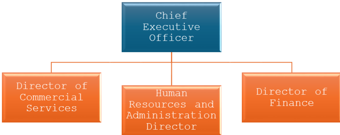
Figure 2: SFFRFM Management Organogram